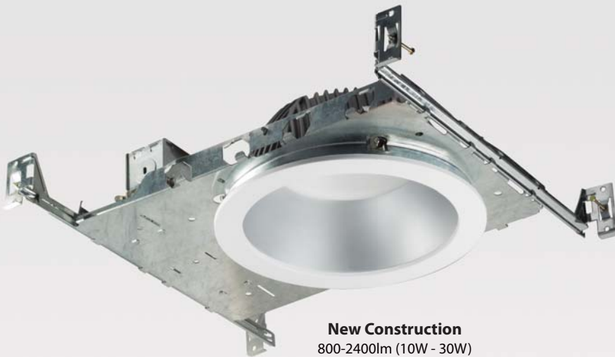
New Construction 800-2400lm (10W - 30W)