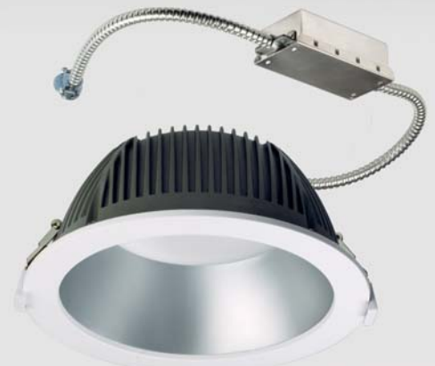
Retrofit/Remodel 800-2400lm (10W - 30W)