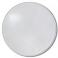
Optional Frosted Lens feature