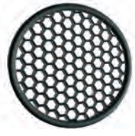
Optional Hex-Cell Louver feature