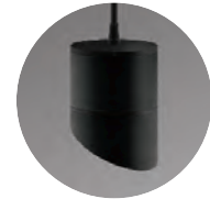
Optional Glare Shield feature