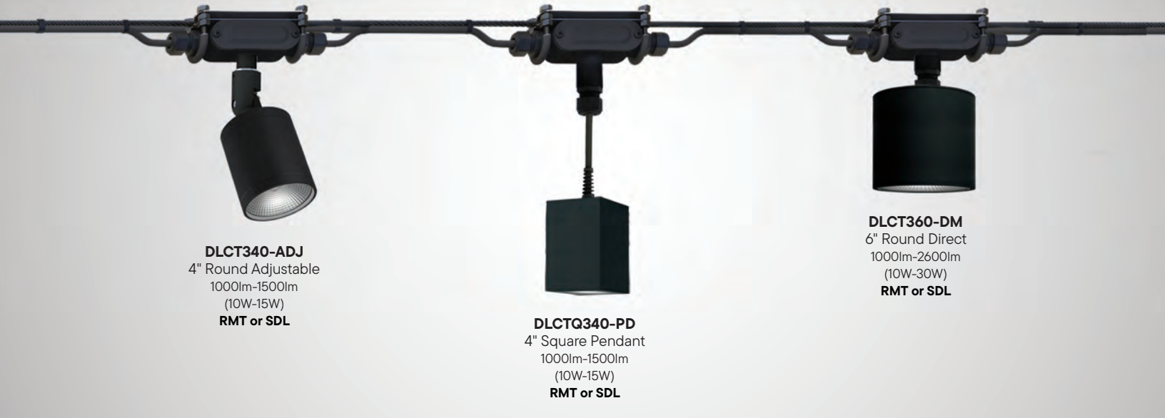
DLCT340-ADJ 4" Round Adjustable 1000lm-1500lm (10W-15W) RMT or SDL