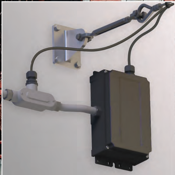
Wall Mount Emergency System (-EMB) feature