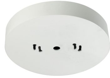
Aluminum body for Consistent Mounting Profile