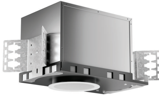
Ceiling Cut-Out: 4-7/8" Ceiling Thickness: 1" Max.