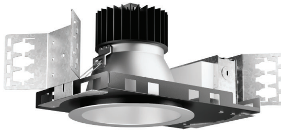
Ceiling Cut-out: 6-3/8" Ceiling Thickness: 1" Max