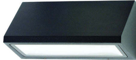
Shown with Signage Plate (-PL)